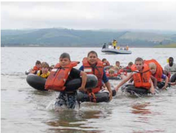
Young cubs get a chance to participate in the raft race during the tube event.....